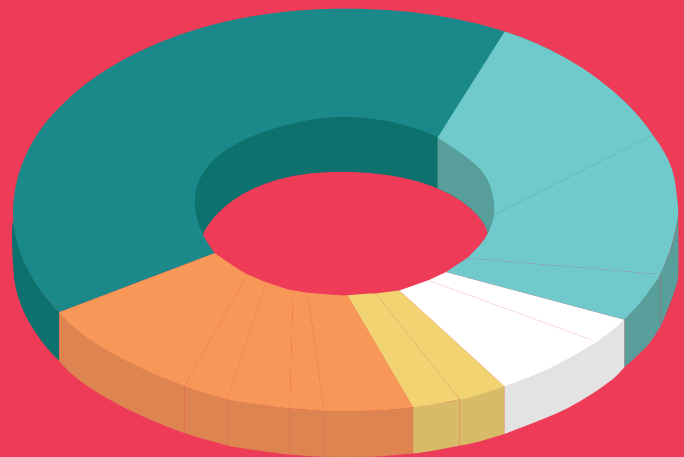
EXPENDITURE PER PROJECT